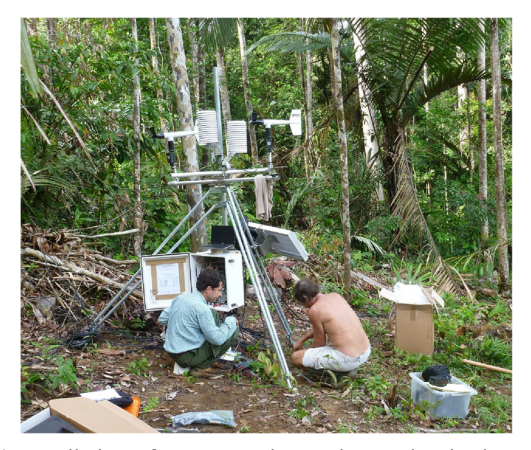
Fig. 4 Installation of an automatic weather station in the tropical rainforest in French Guiana. Long-term monitoring of environmental conditions in remote forest inventory plots is a prerequisite to understand the effect of seasonal or extreme drought on tree and ecosystem functioning and simulate future changes

Most studies published so far have addressed the short-term consequences of extreme droughts; only very few (mainly experimental through-fall studies) have attempted to evaluate their long-term impact (Fig. 4). Despite their tremendous value in the study of response mechanisms, experimental studies cannot mimic the impact of successive, high-frequency major