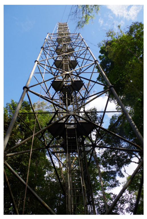
Fig. 3 The 55-m high eddy flux tower set up in 2003 in French Guiana (Bonal et al. 2008). Equipment installed on top of the tower (above the canopy) allows to continuously monitor the gas exchange ( CO_2 , H_2O ) between the atmosphere and the considered ecosystem (around 50–100 ha)

Under extreme drought conditions, GPP is generally moderately further impacted by these extreme conditions, while the decrease in ER is usually much stronger than under recurrent seasonal droughts (synthetized in Shi et al. 2014). This suggests that drought severity could be driving the relative decrease in GPP and ER in these ecosystems. If this is verified, such patterns should be included in modelling approaches. A question which merits further attention then arises: what is the future of the carbon that is not released during severe dry periods, as compared to moderate dry ones? Is this carbon directly released to the atmosphere once heavy rainfalls occur or is it, partly or completely, stored in the ground?