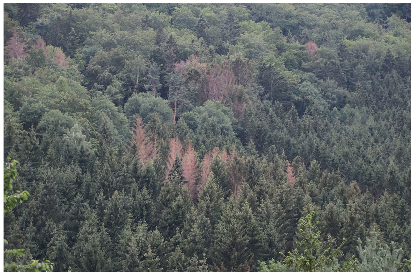
Fig. 7 Bark beetle infestation in Waldviertel/Lower Austria in 2018. After a mild winter and long dry spells during the growing season, heavy bark beetle infestations were recorded.

Besides the immediate need to combat the spread of pests and pathogens, the strategies of adaptive forest management are numerous. It is possible to amend the forests with additional species, and thinnings can improve the water availability for individual trees. Even the rotation period can often be reduced because longer growing seasons allow reaching target dimensions of the timber market earlier. However, with