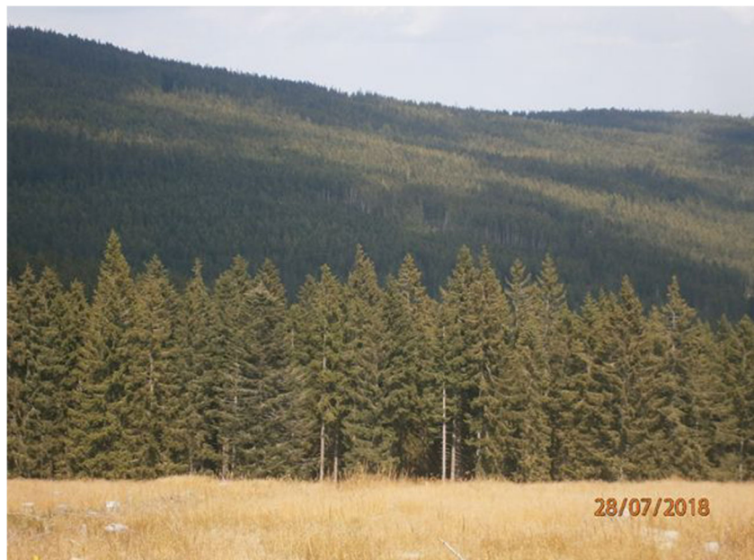
Fig. 8 Mountain Norway spruce forest in Styria, Austria. The forests are widely dominated with Norway spruce.

The forests of British Columbia (B.C.), Canada, provide a contrasting case study when considering adapting forest management practices in the face of climate change. Most forests in B.C. are first-growth and the distribution of tree species reflects the current or past climate. This relationship is reflected in the biogeoclimatic classification of B.C. forests, which underlies all forest management decisions in the Province. Most sites are regenerated naturally or artificially with the species that occur naturally on the site, so second-growth forests also reflect current and past climates. Models have been developed to predict future climate envelopes and future optimal distributions of tree species in B.C. as related to climate (Hamann and Wang 2006). The distances involved in these climate envelope shifts make it unlikely that the species could make the necessary range shifts without assistance. In this situation, both the passive and business-as-usual scenarios carry the risk that the species present on a site in a few decades may not be well adapted to the site conditions. Such effects are already apparent in the decline of yellow cedar ( Cupressus nootkatensis ) at the lower extent of its past elevation range (Hennon and Shaw 1994), and the ongoing death of red-cedar ( Thuja plicata ) trees on dry sites within its current range (Wilson and Hebda 2008). Active adaptation would entail a revision of planting guidelines to reflect future site conditions