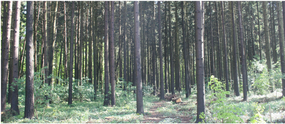
Fig. 6 Secondary spruce forest in Lower Austria. The spruce-dominated stand is approximately 80 years old. In the understory layer, deciduous tree species are regenerating.

conditions may keep the window for spruce management open under future climate conditions. In addition, Silver fir is seen as option at sites that are unsuitable for Norway spruce (Kapeller et al. 2012; George et al. 2015).