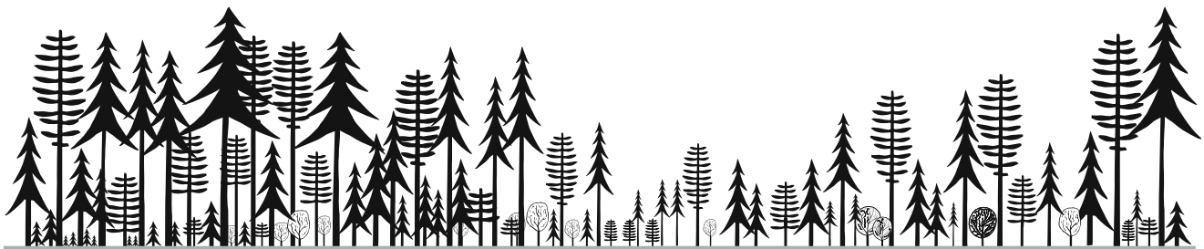
Fig. 3 Idealized Plenterwald as proxy for structural diversity in managed forests

European beech is the major tree species of the natural forest vegetation in large parts of central and Western Europe (Bohn