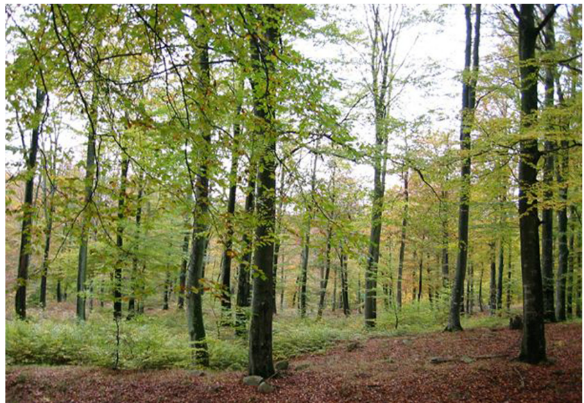
Fig. 4 Near-natural beech old-growth forest with natural regeneration in southern Sweden.

On privately owned land forest management, decisions are mostly made by the farmers themselves. The owners are forced to cope with increasing production costs under naturally challenging conditions (Streifeneder et al. 2007). Forest practitioners are advised to continue the present